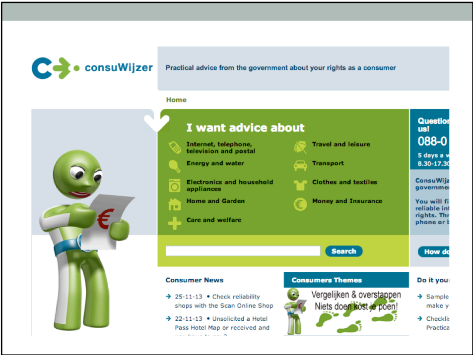
The result is ConsuWijzer